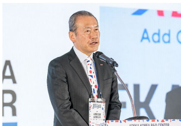
▲ Opening Ceremony (held on March 29, 2024)