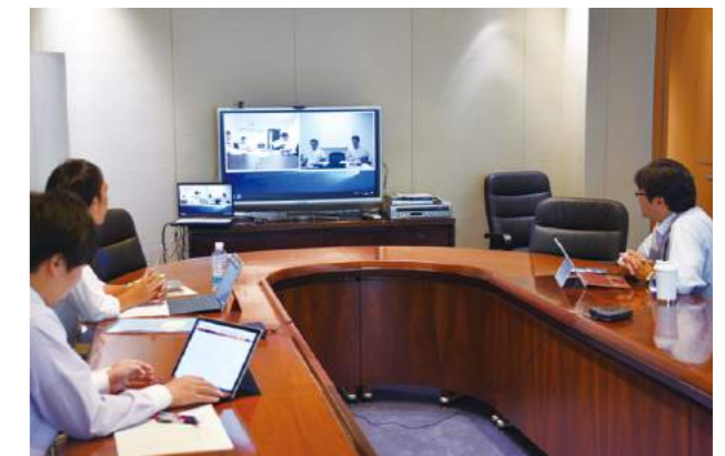
Procurement conference with the Singapore and Malaysia bases

The ADEKA Group makes various efforts to achieve optimal global procurement. Our Global Management System (GMS) facilitates the sharing of purchase data at each global site. Furthermore, our regional purchasing staff cooperate with each other to integrate the procurement of common raw materials and share supplier information. We have also started dispatching our chemical purchasing staff to overseas bases. And we will further strengthen cooperative relationships with overseas bases through such opportunities as providing guidance, training local purchasing staff and conducting staff exchanges.