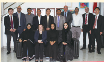
Participants of the technical seminar on polymer additives

Throughout the technical seminar, I was impressed by the highly advanced clean plant and reminded of the ADEKA Group's technological strengths. The experience left me even more convinced that partnering with ADEKA will enhance our technological competence.