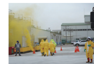
ADEKA KOREA CORP. (South Korea) participates in a joint government-private sector drill for preventing leakage of toxic substances