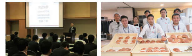
Seminar for new employees of ADEKA and its distributors (ADEKA University for the chemicals business and Risu University for the food business)

The ADEKA Group will evolve in step with distributors who deliver products to our customers. Placing customers above all else, we promote initiatives that transcend corporate boundaries, such as holding regular meetings for special agents, in which we explain our business policies and plans. We also organize intensive seminars for new employees in the chemicals and food businesses, both at ADEKA and at our distributors, where participants learn about negotiation skills and acquire knowledge about products and technologies.