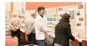
CSR activity presentation for the local community by the Mie Plant (Japan)