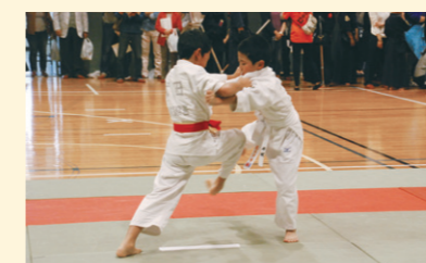
Holding the ADEKA Cup, a judo and kendo tournament for elementary and junior high school students

The ADEKA Group engages in a broad range of activities in the hope of contributing to the healthy development of children as they head into the future. Also, in fiscal 2016 we actively supported students, who share in our quest for science, through a 2.9 million yen donation.