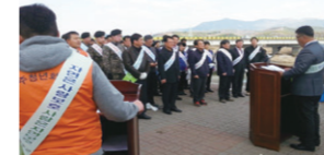
ADEKA KOREA CORP. (South Korea) participates in a river purification project