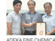
ADEKA FINE CHEMICAL TAIWAN CORP. (Taiwan) receives the Excellent Bonded Factory Award