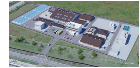
Rendering of completed R&D and production facility for fisheries and seeding of Fukushima Prefecture