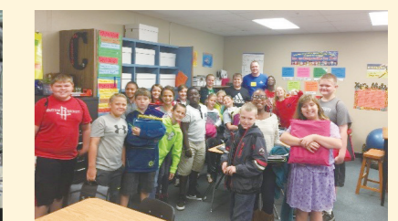
AMFINE CHEMICAL CORP. (United States) participates in a church program