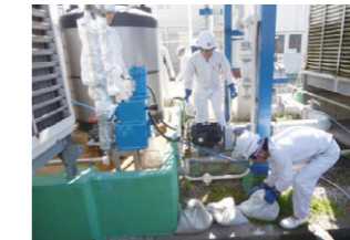
Akashi Plant (Japan) representatives drill to prevent abnormal discharge of wastewater

Security and disaster prevention are the most important responsibilities of ADEKA Group production sites that handle hazardous and toxic materials. To gain the trust of the local community, we not only comply with relevant laws and regulations but also rigorously manage processes, facility maintenance, and voluntary safety.