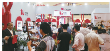
Exhibiting at a bread trade show in China

The ADEKA Group participates in exhibits and conferences as a means of promoting its products, technologies, and solutions. In the areas of chemicals and foods, customer needs for products and technologies are growing in diversity and sophistication. And so these exhibitions provide us with invaluable opportunities to introduce our products in response to customer needs. In fiscal 2016, we participated in 26 exhibitions for chemicals and foods.