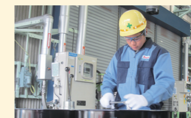
Mie Plant (Japan) accepts elementary and junior high school students for a work experience program