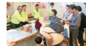
Kashima Plant (Japan) exhibiting at a local industry festival