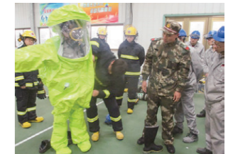
ADEKA FOODS (CHANGSHU) CO., LTD. (China) conducts a firefighting gear drill