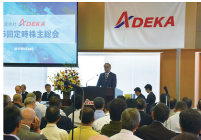
155th Annual General Meeting of Shareholders

The company observes a silent period preceding the announcement of its financial results to refrain from commenting on specific topics and from disclosing any unconfirmed information prior to the announcement. However, the company will disclose information should it determine that the content of its financial results would significantly impact shareholders and investors.