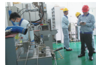
Onsite inspection at an overseas Group production site

In fiscal 2016, onsite inspections were conducted at the overseas production sites where accidents had occurred. Information on prevention measures and details on the guidance provided during the onsite inspections were shared with the local companies, the main plant in Japan, and the Environment Safety & Quality Assurance Department, and follow-up was also provided.