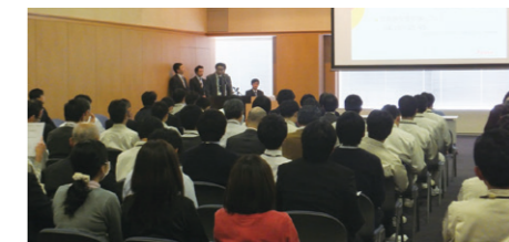
Overseas crisis management seminar

Employees working overseas use the medical examination program as well as telephone interviews with an industrial doctor or face-to-face interviews with the doctor during temporary returns. A 24-hour medical assistance service provides consultation with doctors and other support for any emergency that may arise during an employee's overseas stay. In addition, we have been taking steps since fiscal 2016 to provide external training for medical and mental health care to all employees scheduled to work overseas as well as their families. We will continue our health and safety training activities to improve employee awareness of health management.