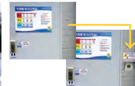
Installing a static electricity removal sheet in front of dangerous goods warehouses to eliminate the risk of ignition accidents

Activities to redress unsafe factors Eliminating potential causes of accidents by making improvements to unsafe areas on equipment and devices