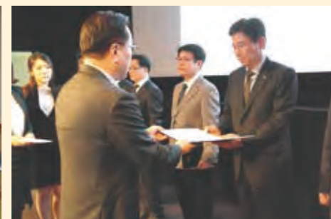
Awarded the Innovation Prize in the Samsung Electronics Co., LTD. Safety Innovation Contest