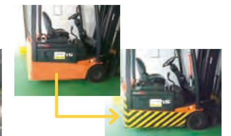
Reflective tape is stuck on forklifts, and speed limits are imposed on them to improve their visibility while working at night

Through these activities, employees dramatically raised their awareness for the environment, health and work safety, and we have been winning high appraisal from customers who visit the company. However, there is no endpoint to our efforts to ensure safety. We will continue to strive in pursuit of safety