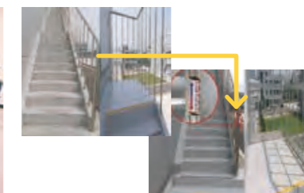
Stairs are given slip resistant surfaces to prevent slipping, and a fence is erected along the side to prevent secondary accidents