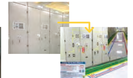
Displaying of wiring path and procedures on power receiver panels allowing anyone to restore power during blackouts

Activities to improve visibility of notices Posting of safety notices all around the plant to share awareness for safety among all employees