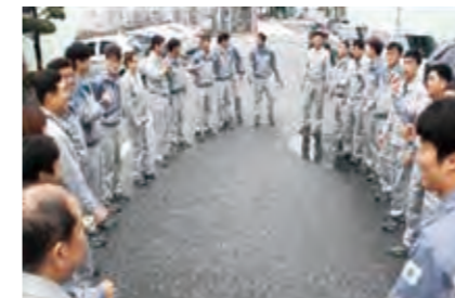
Saying the safety slogans out loud before commencing work or meetings

Activities to improve the culture of safety Cultivating a corporate culture of pursuing safety and striving to enhance employee awareness of safety