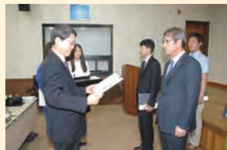
Awarded the Environment Minister's prize of the Ministry of Environment (Republic of Korea)