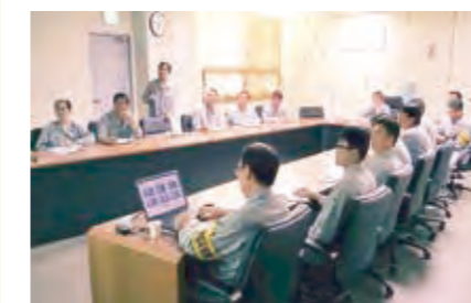
Holding of EHS executive meetings every week to ensure internal sharing of improvements between departments